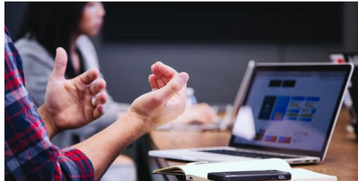
Tailored in-house and digital training