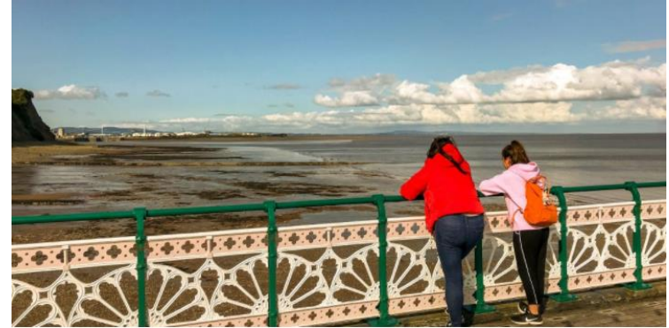
SEND Teacher Training